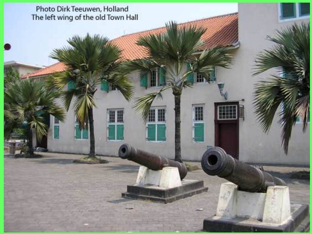
3. The eastern wing of the old Town Hall, this wing was used by the Dutch East-India Company (VOC), the ground floor was a prison Photo Dirk Teeuwen Holland, 2006