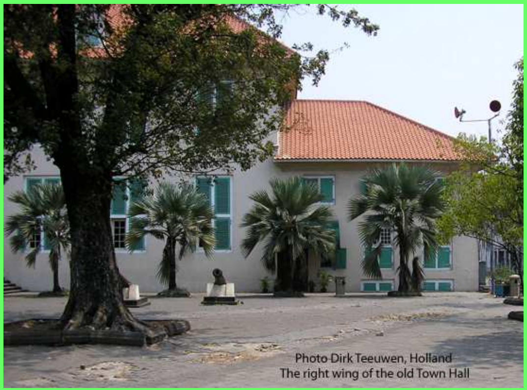
4. The western wing of the old Town Hall, this wing was used by the Municipality of Batavia, the ground floor was a prison