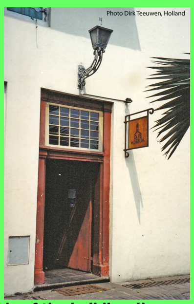
5. Door at the very left side of the building (lower wing), an entrance of this prison of the Dutch East-India Company, now the access to the Indonesian Café "Stadhuis" (Café Town Hall) Photo Dirk Teeuwen Holland, 2006